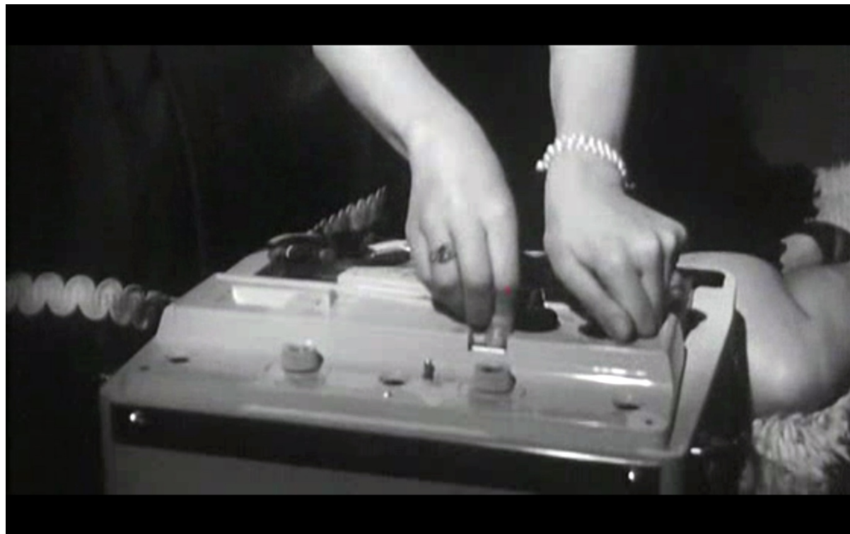
film still from Antonioni's La Notte (1961)