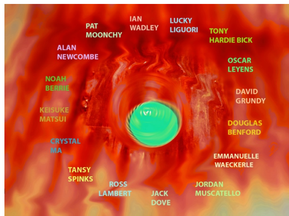
for the workshop facebook page)