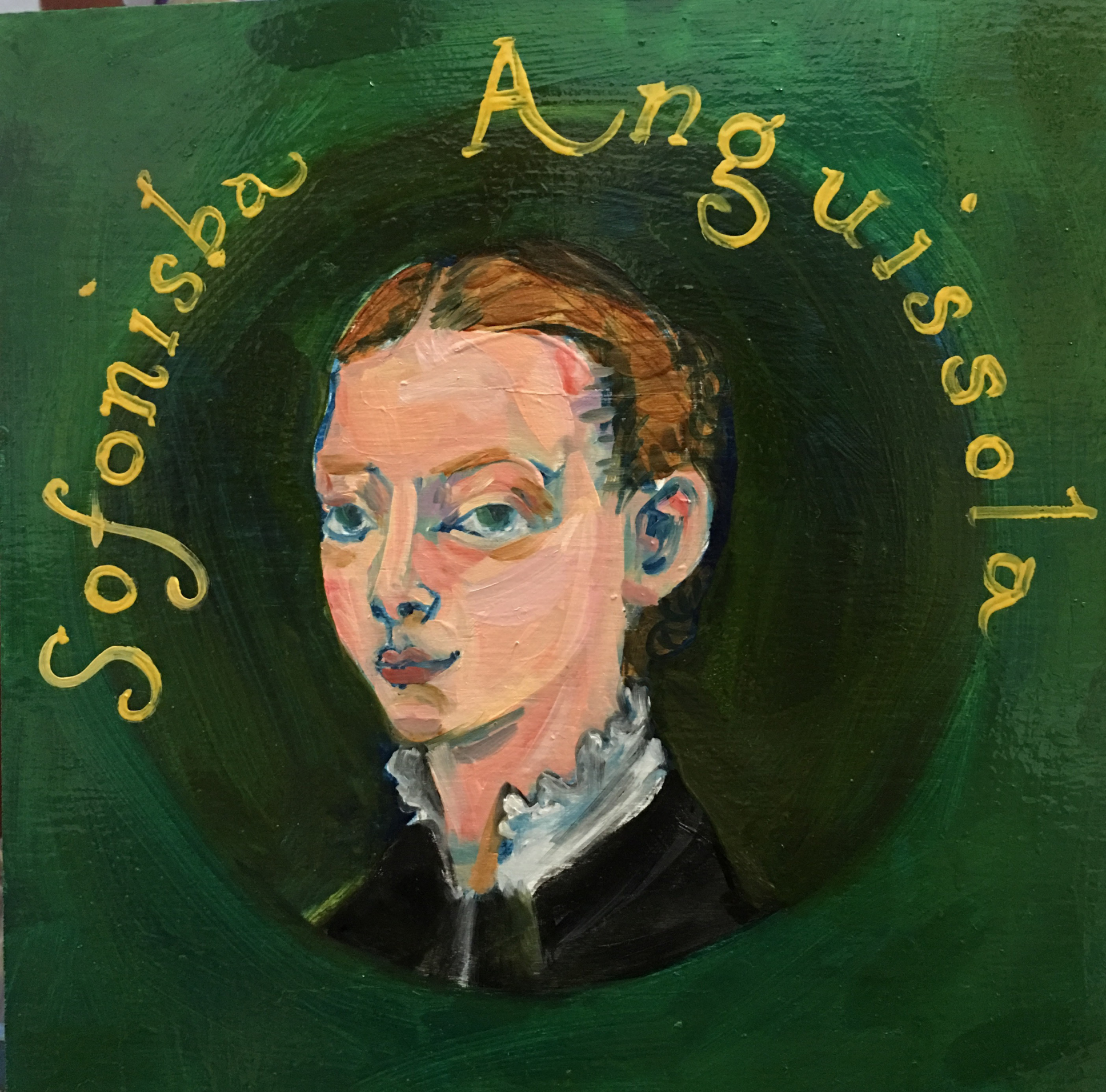
Secret to a Good Life, 'This is Angelica Kauffman RA (detail of Sofonisba Anguissola), Royal Academy 2018