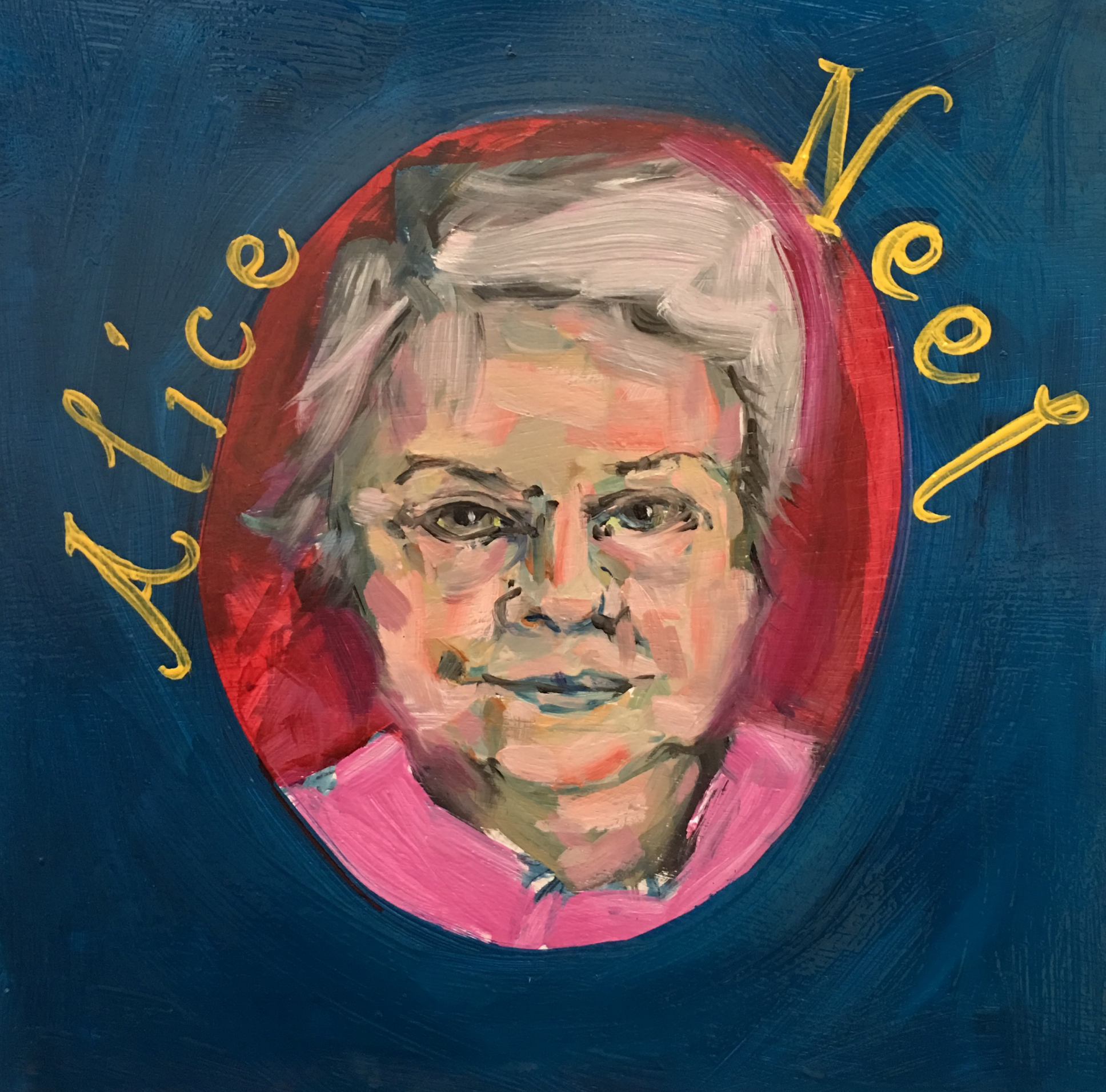
Secret to a Good Life, 'This is Angelica Kauffman RA (detail of Alice Neel) Royal Academy 2018