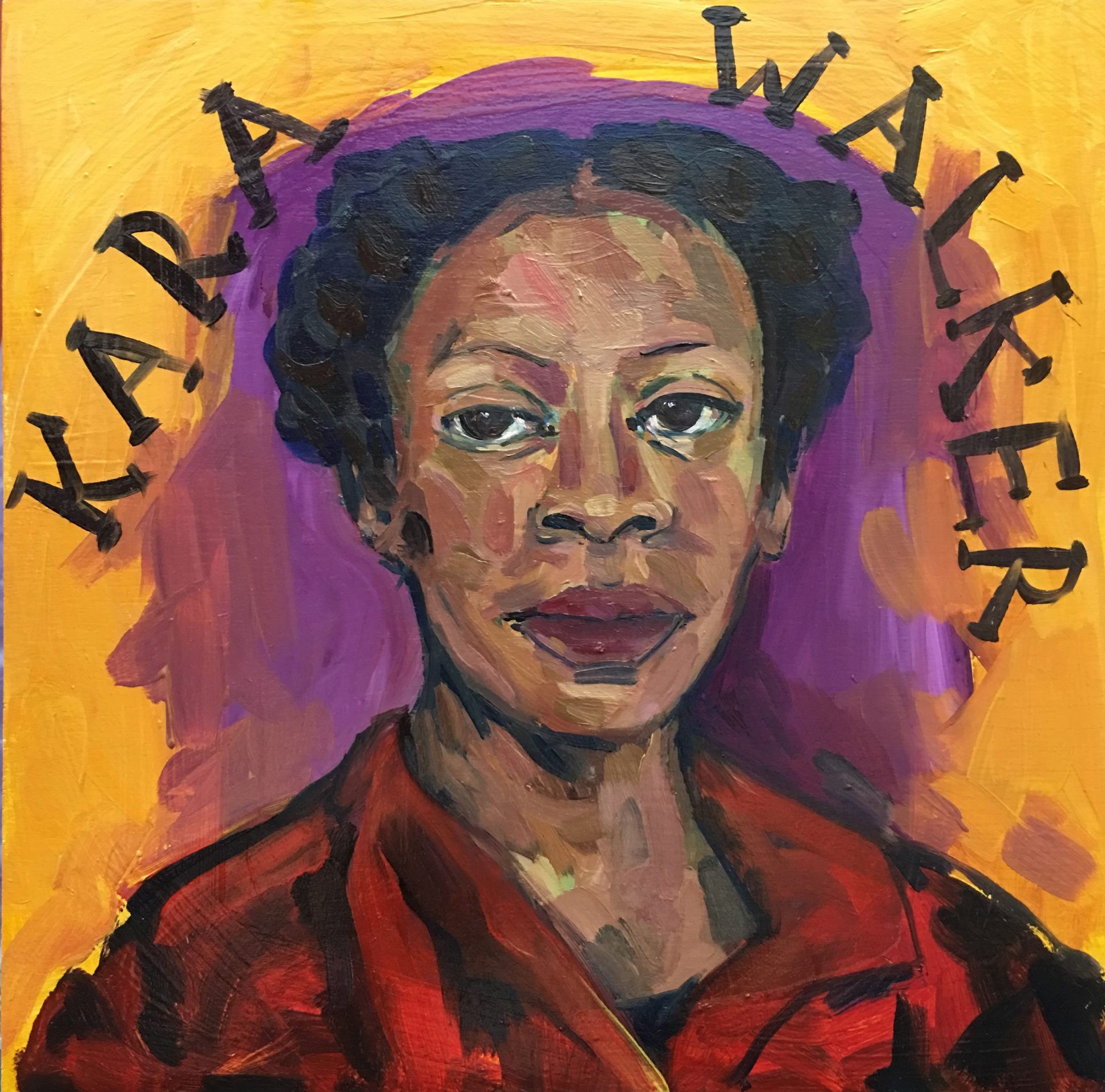
Secret to a Good Life, 'This is Angelica Kauffman RA (detail of Kara Walker), Royal Academy 2018