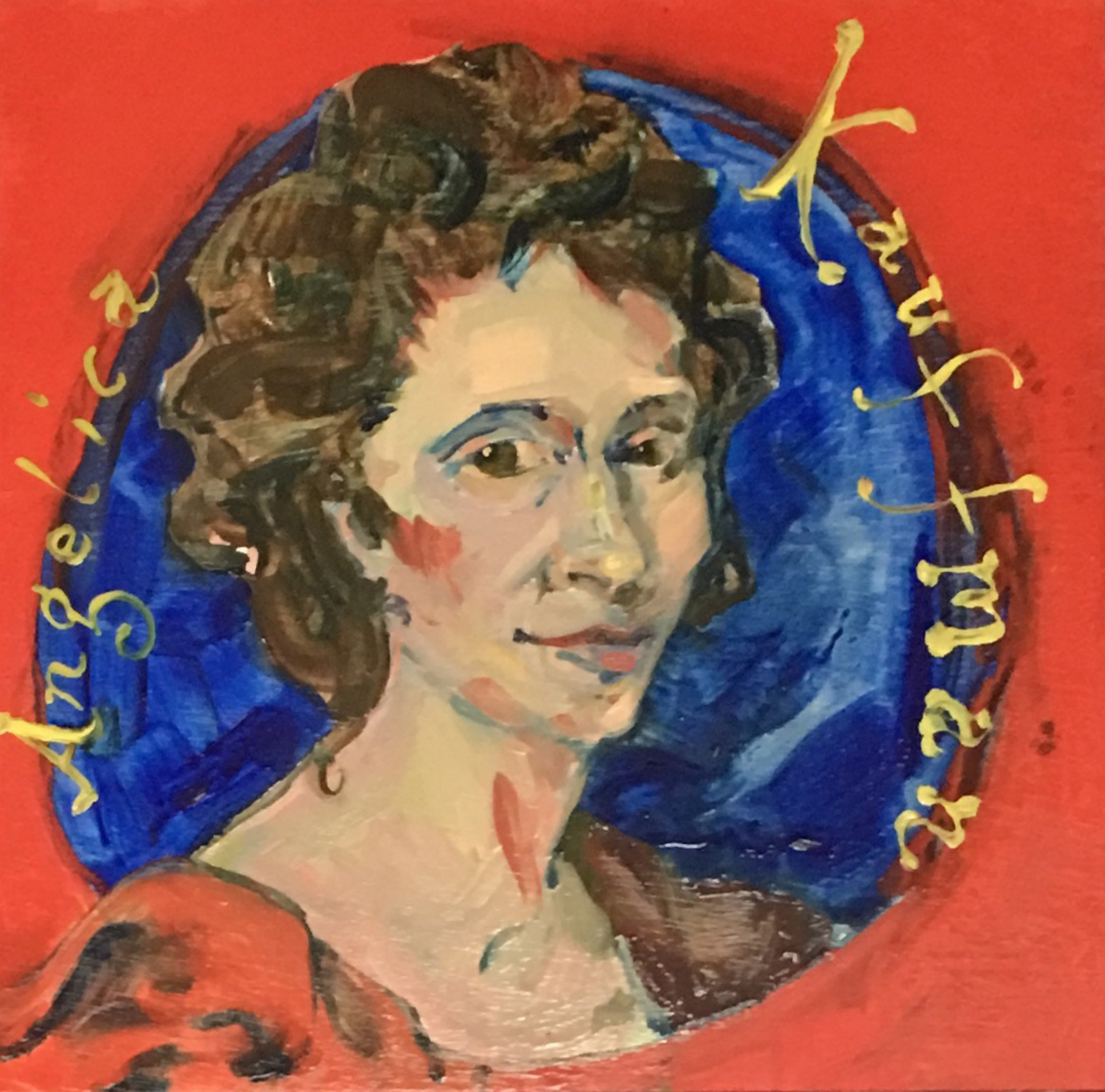
Secret to a Good Life, 'This is Angelica Kauffman RA (detail of Angelica Kauffman), Royal Academy 2018