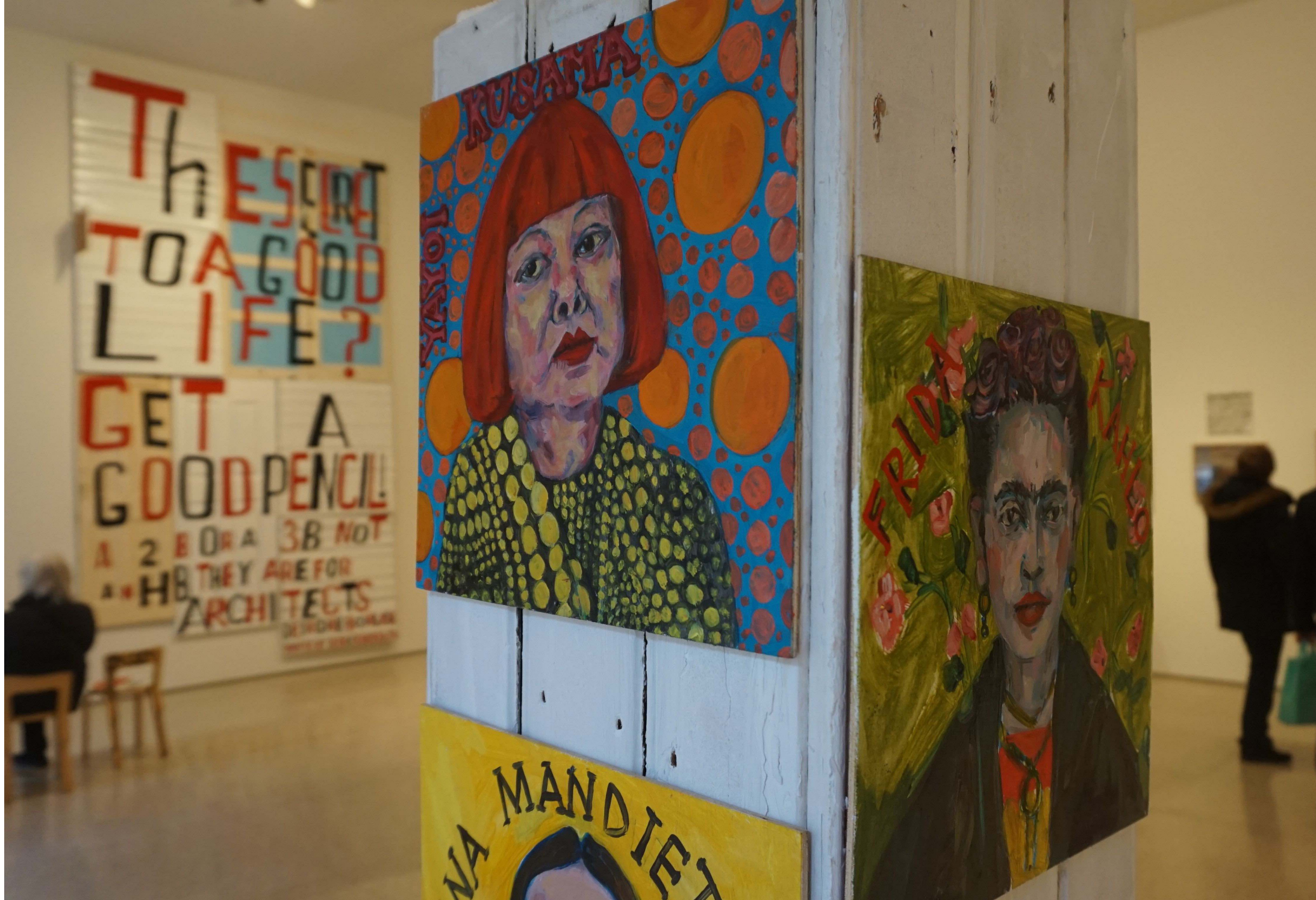
Installation View, Secret to a Good Life, Royal Academy with 'This is Angelica Kauffman RA' in the foreground