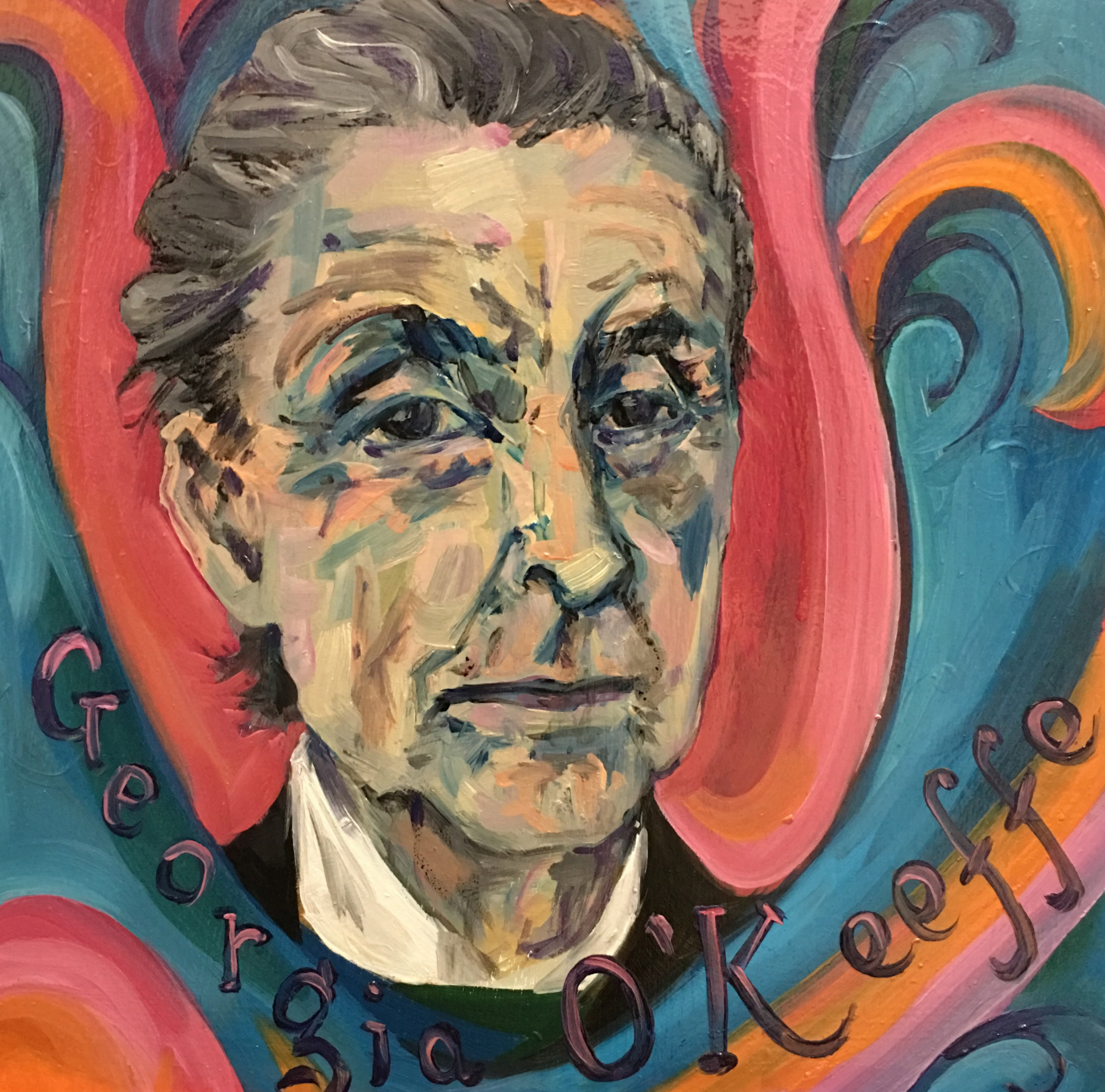
Secret to a Good Life, 'This is Angelica Kauffman RA (detail of Georgia O'Keefe), Royal Academy 2018