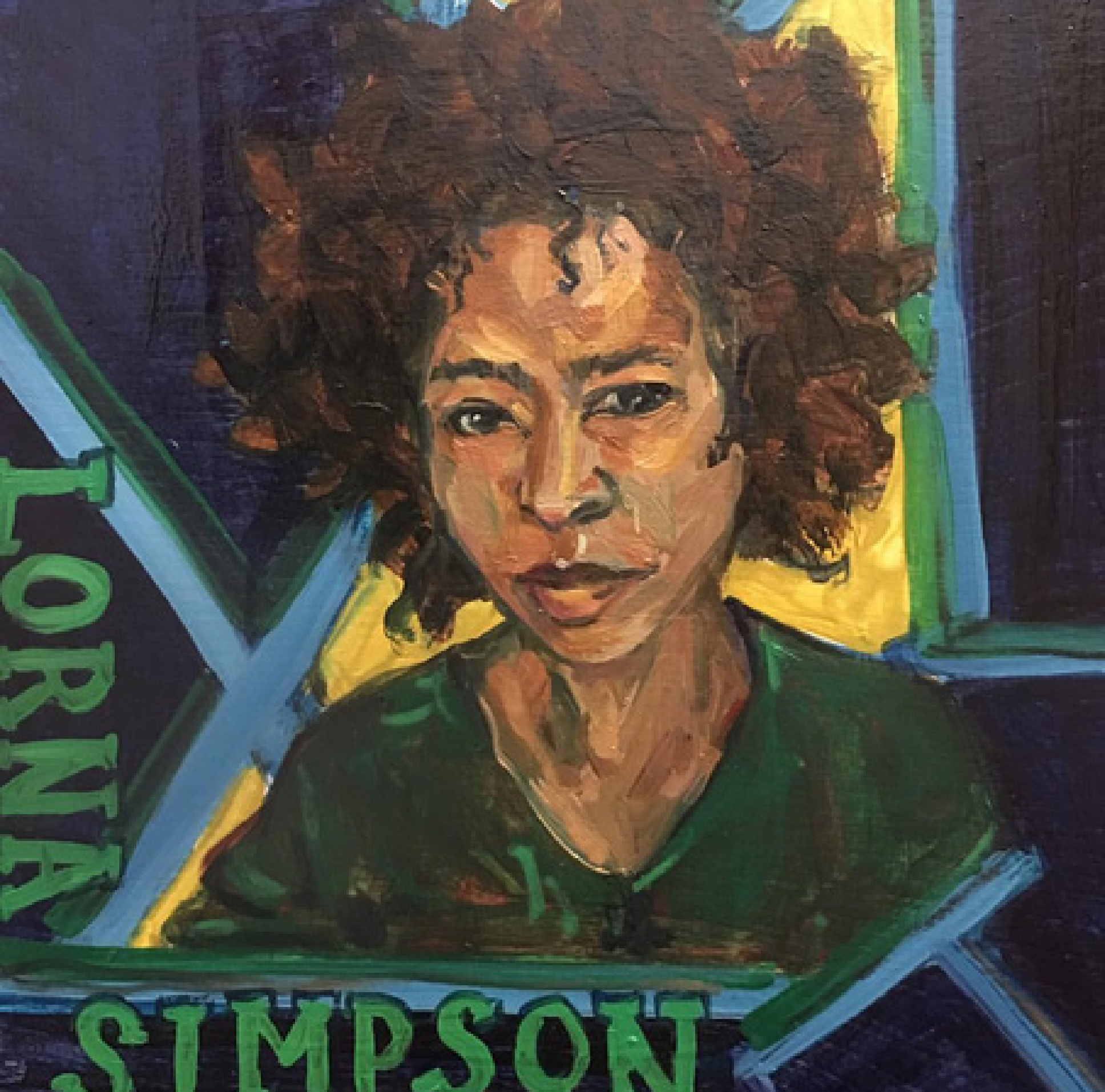
Secret to a Good Life, 'This is Angelica Kauffman RA (detail of Lorna Simpson), Royal Academy 2018