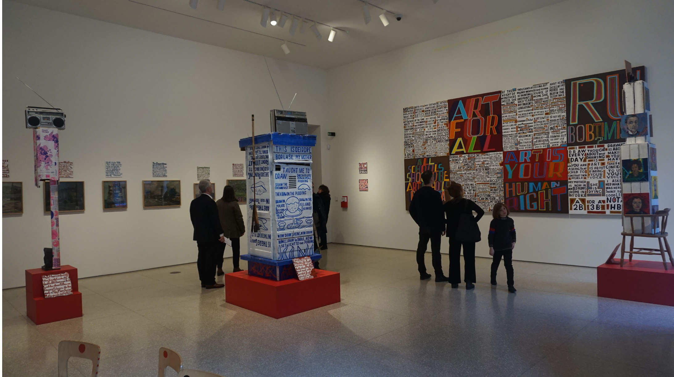
Installation View, Secret to a Good Life, Royal Academy, 2018