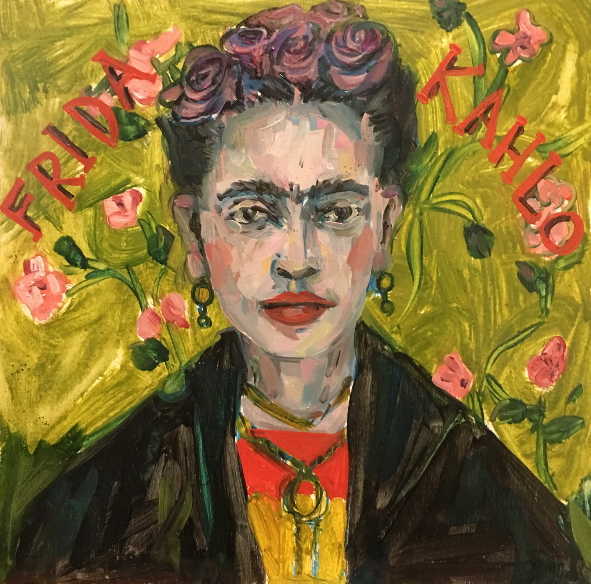
Secret to a Good Life, 'This is Angelica Kauffman RA (detail of Frida Kahlo), Royal Academy 2018