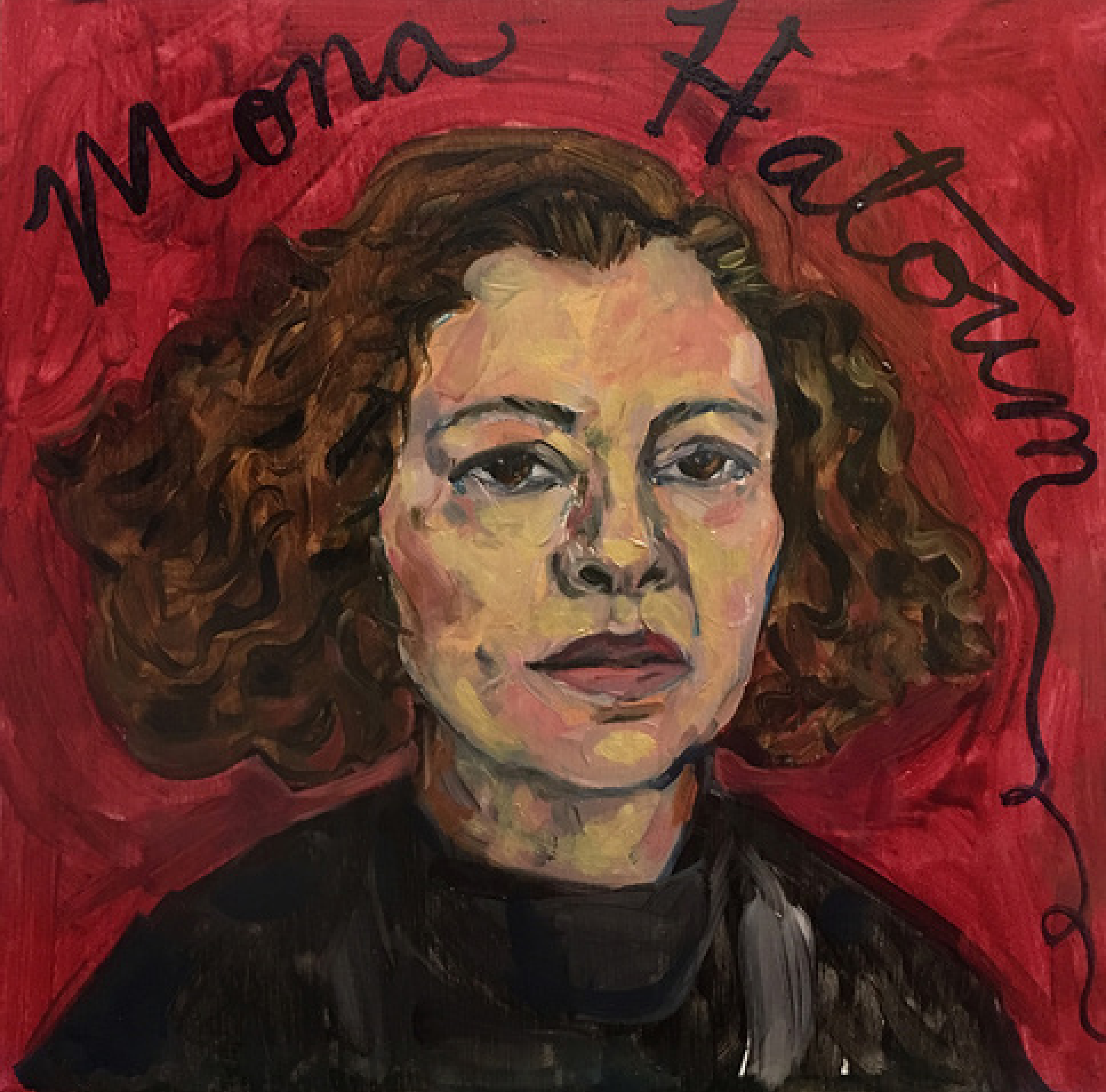
Secret to a Good Life, 'This is Angelica Kauffman RA (detail of Mona Hatoum), Royal Academy 2018