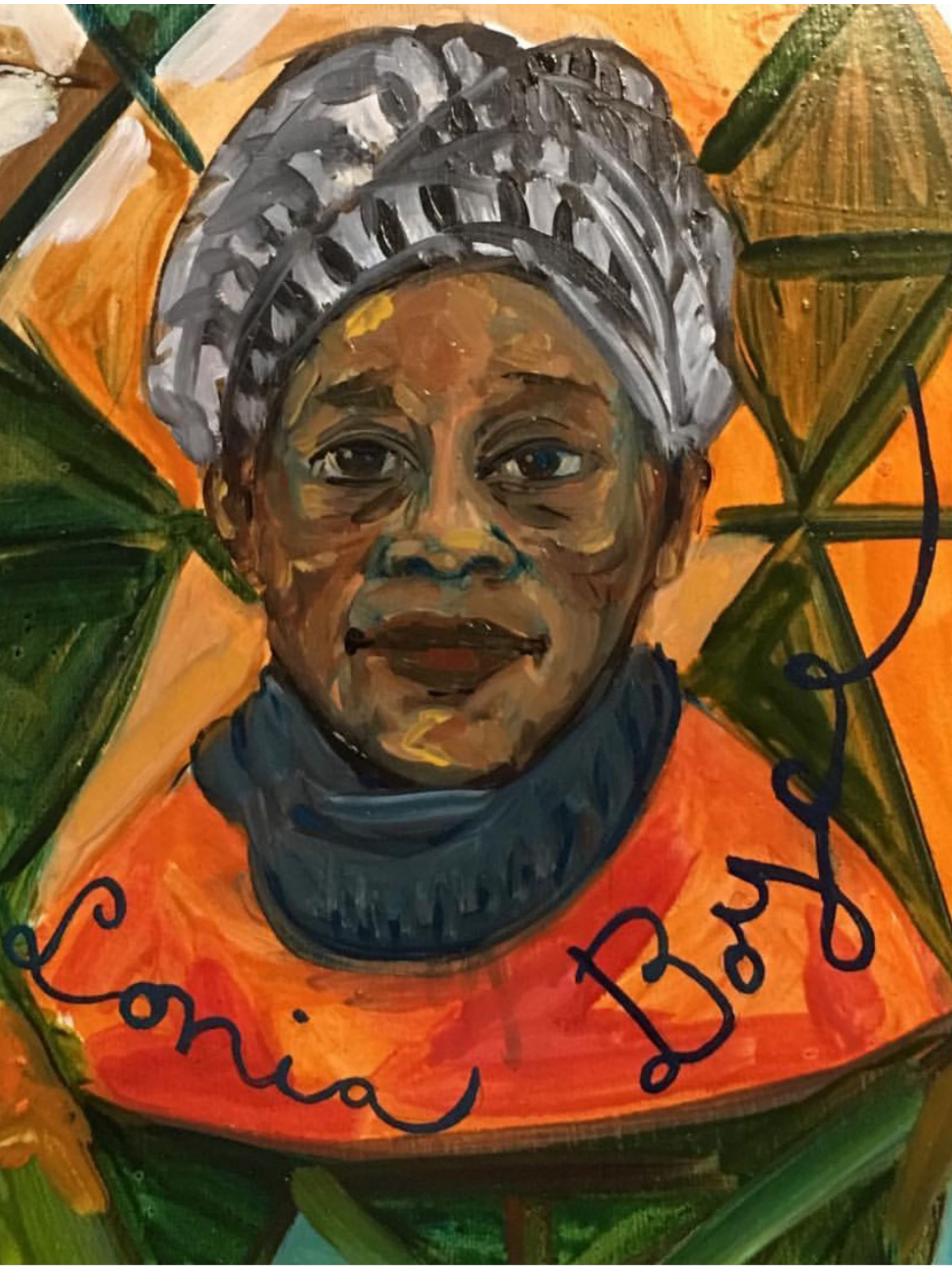
Secret to a Good Life, 'This is Angelica Kauffman RA (detail of Sonia Boyce), Royal Academy 2018