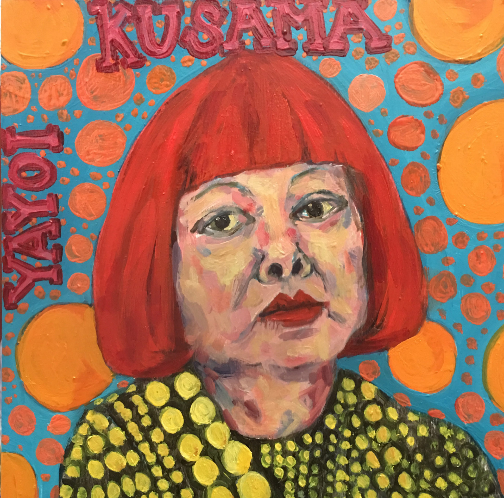
Secret to a Good Life, 'This is Angelica Kauffman RA (detail of Yayoi Kusama) Royal Academy 2018