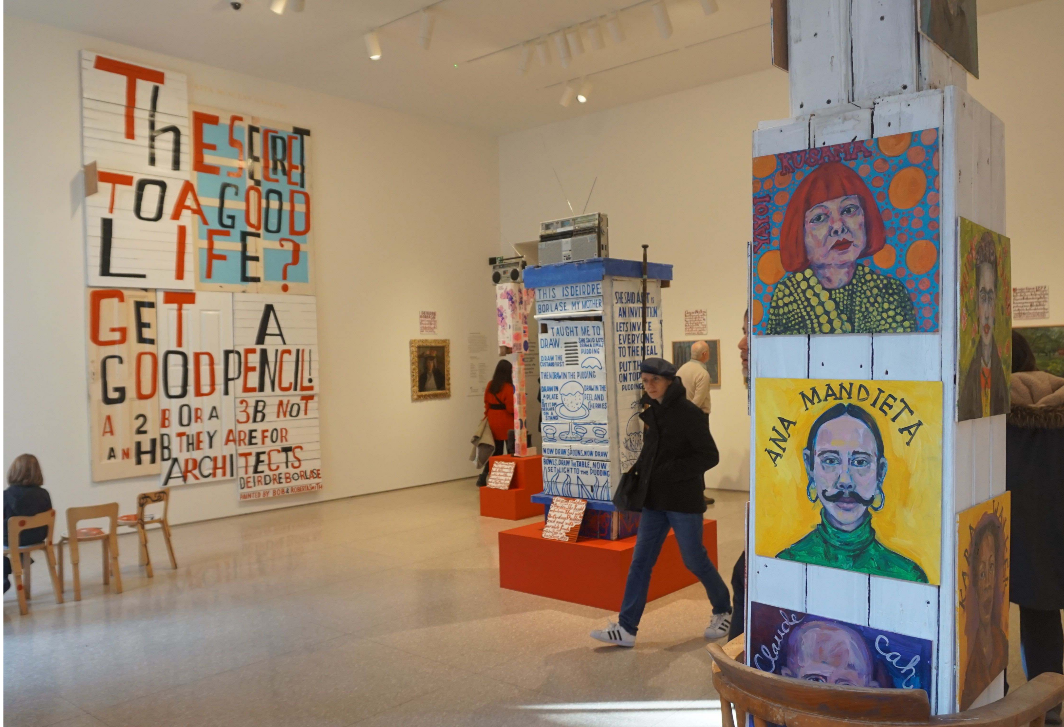
Installation View, Secret to a Good Life, Royal Academy. 'This is Angelica Kauffman RA' is in the foreground