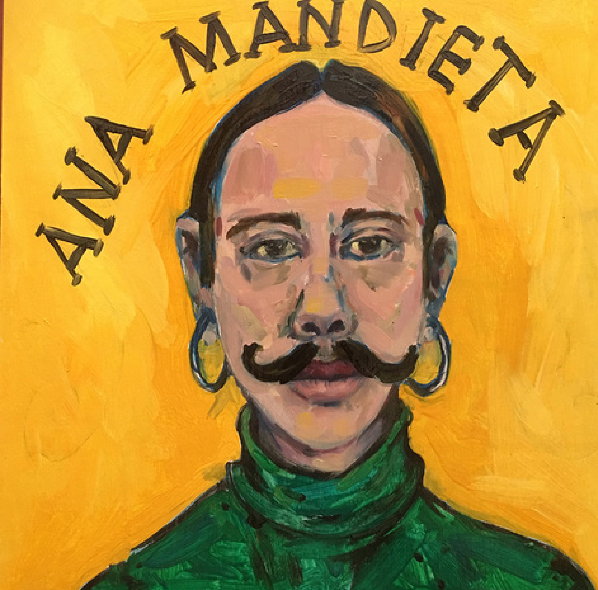
Secret to a Good Life, 'This is Angelica Kauffman RA (detail of Ana Mandieta), Royal Academy 2018