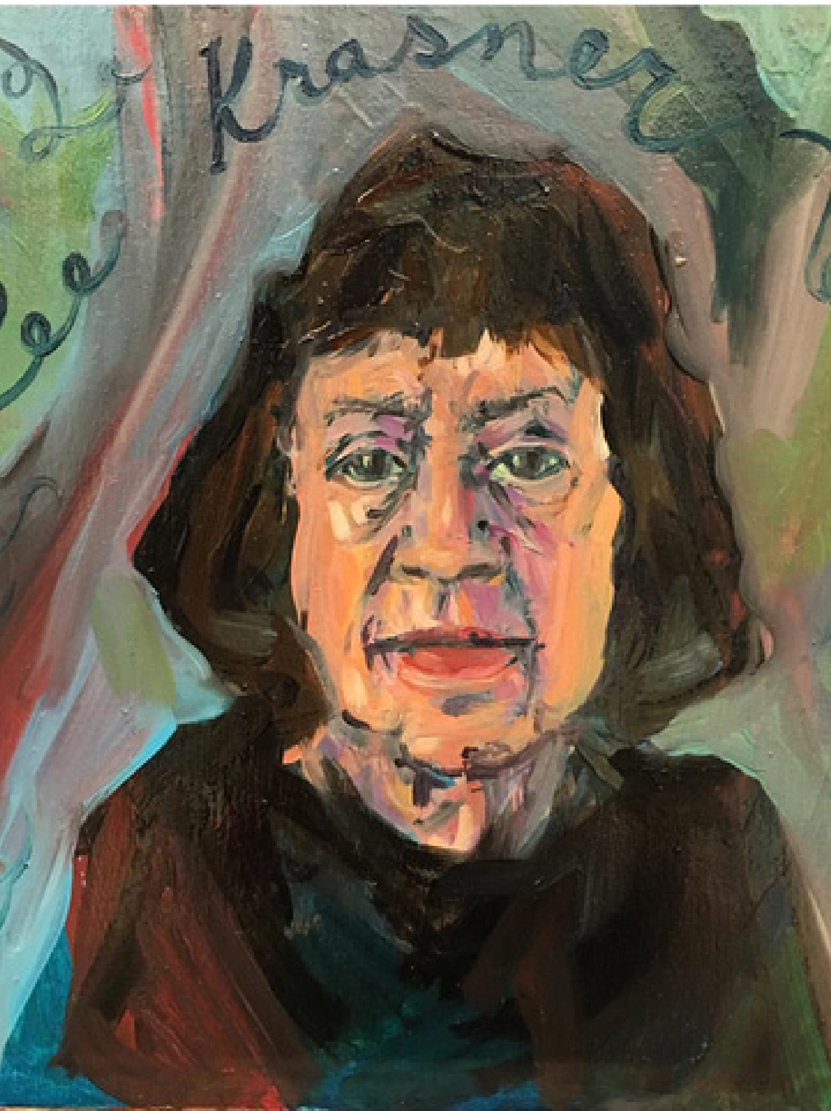
Secret to a Good Life, 'This is Angelica Kauffman RA (detail of Lee Krasner), Royal Academy 2018