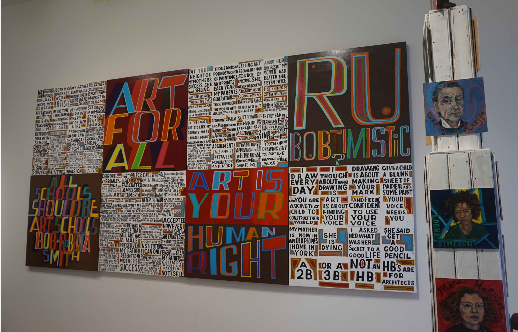
Installation View, Secret to a Good Life, Royal Academy. 'This is Angelica Kauffman RA' is to the far right, Bob and Roberta Smith's [book] text panels are in the centre