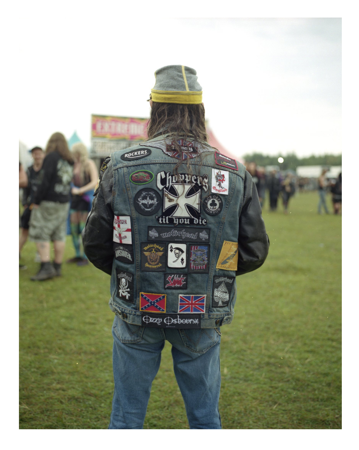
Figure 2: Jacket featuring biker patches alongside metal band logos. Bloodstock festival, Derbyshire, United Kingdom, 09.08.14.