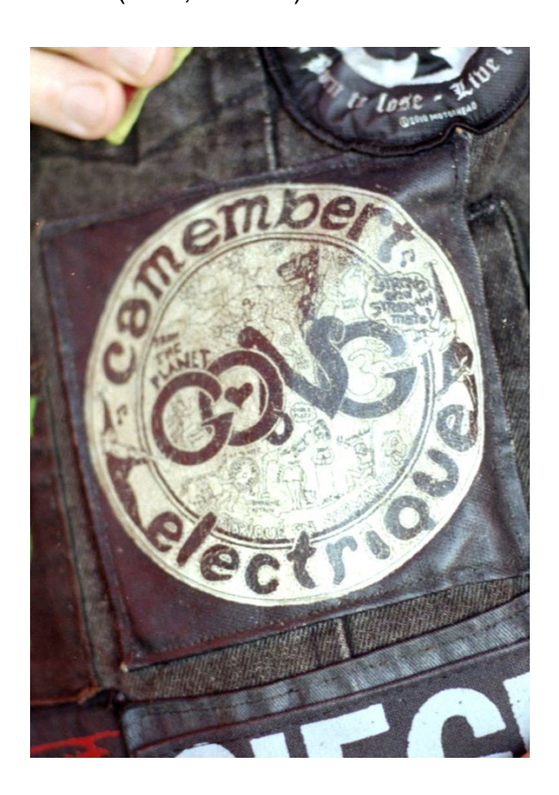
Figures 7 and 8: Pete with his jacket and detail showing hand-painted Gong patch. Bloodstock festival, Derbyshire, United Kingdom, 09.08.14.

Jeanie Finlay's documentary Sound It Out (2011) portrays an independent record shop in the north of England and profiles some of its regular customers. Part of the film focuses on two metal fans, Sam and Gareth, who