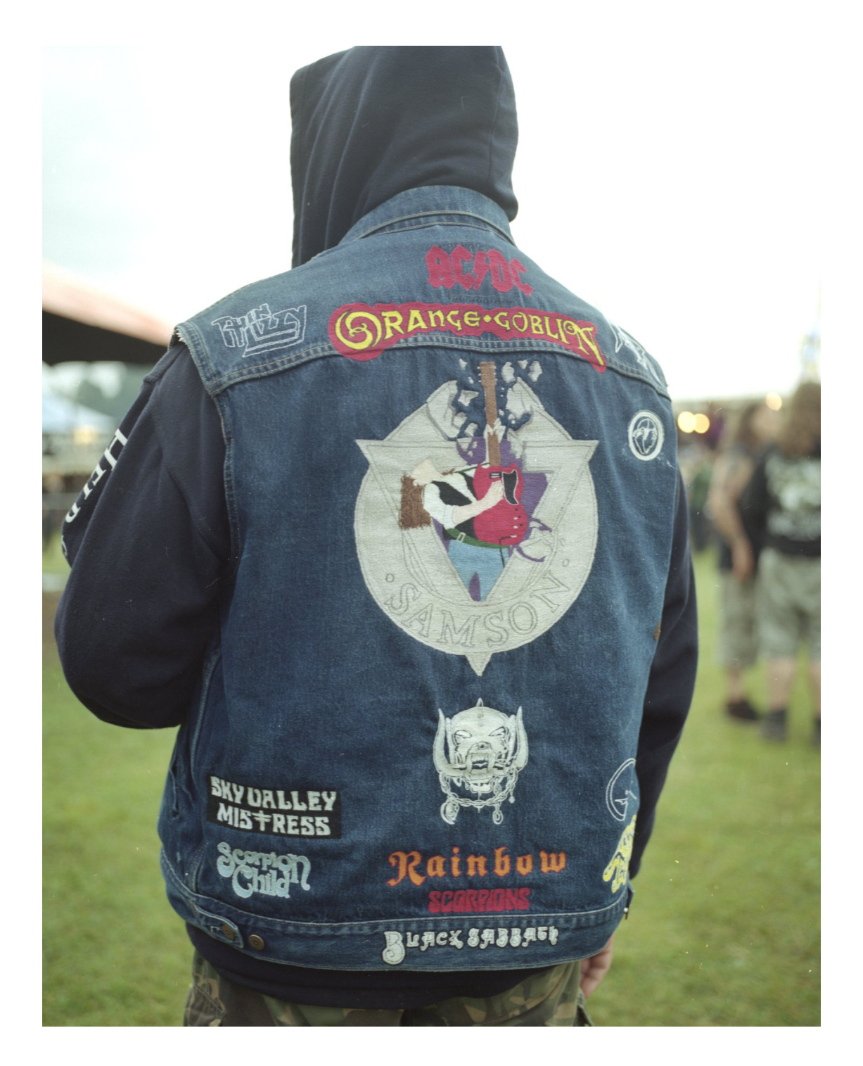
Figure 3: Jacket featuring hand-embroidered logos. Bloodstock festival, Derbyshire, United Kingdom, 09.08.14.