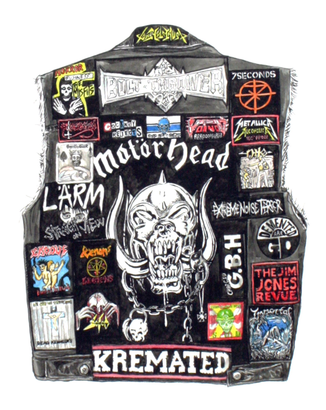
Figure 1: Tom Cardwell: Pete's Jacket, back. Watercolour on paper 38 x 26 cms, 2015.