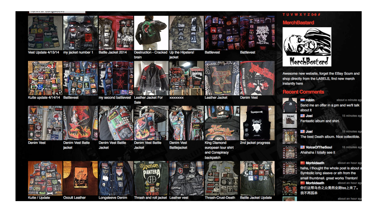
Figure 4: Battle jackets displayed on forum tshirtslayer.com