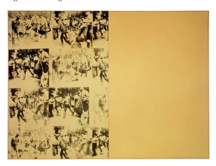
Figure 3 Andy Warhol, Mustard Race Riot, 1963, synthetic polymer paint and silkscreen ink on canvas, 289.76 x 213.36cm each (two panels), Museum Brandhorst, Munich.

In the Race Riot sequence there is no expert discussion on the placement of Moore's images and the significant differences between the two paintings. Instead, we are shown the canvases in zooms and tracking shots and significantly we are placed as if viewers at the actual scene. We can visually access the fact that Mustard Race Riot is a diptych, with a mustard monochrome canvas on the right-hand side (fig. 3). (This is a device that Warhol first deployed in his Death and Disaster series.) We see a repetition of four rows of three of Moore's photographs with the cropping of each image on the far right-hand side.