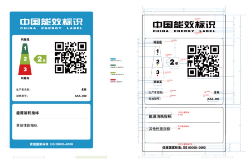
Chart 2. Sample of CEL without Top Runner Logo

In August 2015, ten years after the implementation of MAEEL, NDRC and SAMR issued a revised version of MAEEL to promote higher efficiency and energy-saving products, in accordance with the Law of Energy Conservation and the Action Plan for Energy Conservation and Emission Reduction and Low Carbon Development (2014- 2015). On 1<sup>st</sup> October 2016, a new CEL with a QR code format was launched<sup>29</sup>.