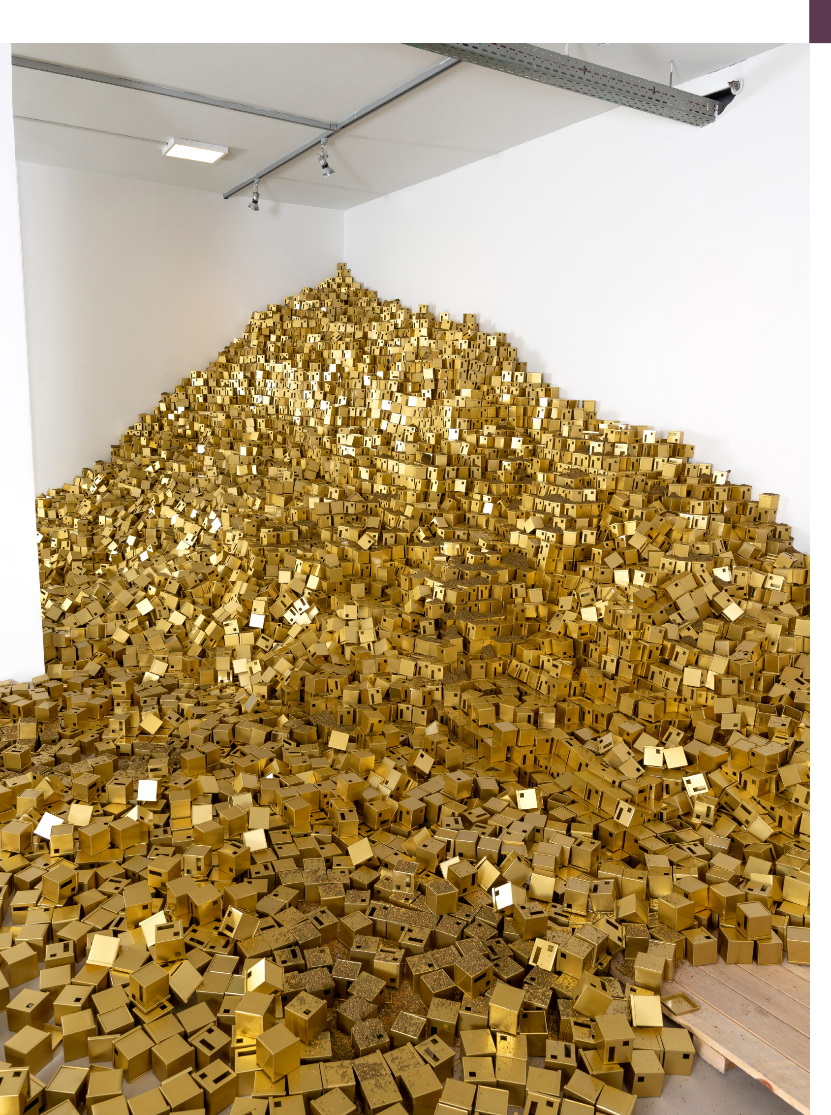
'Shift', 2018, tin and za'atar