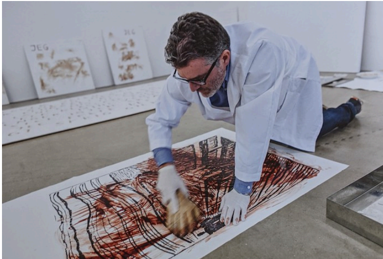
Figure 5 Morten Viskum, The Scream , 2015. Still from performance. Blood and silkscreen on canvas. © Morten Viskum.

Over the next few months we discussed many of Viskum's individual works. In the transcript I edited the questions I had asked at the time to include further references to art-historical works and some of my own comments. For example, in the first interview I pose the question, 'You specifically wanted a hand? Was that because in your mind as well you were thinking about the hand of the artist?' Viskum responds, laughing wryly,