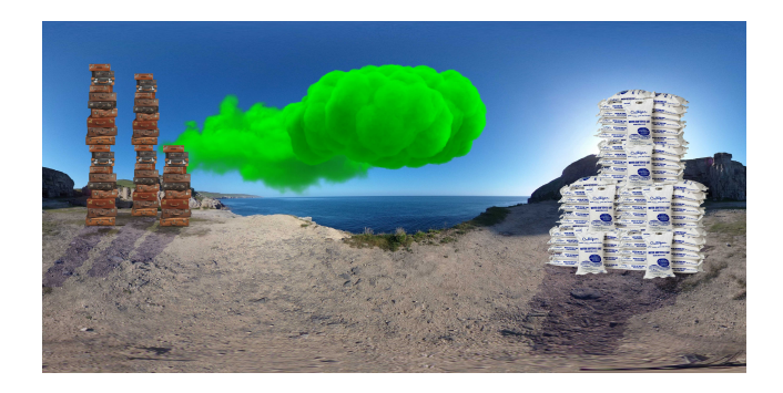
Figure 1. Mock-up of equirectangular 360° environment with augmented animation elements.

level and a tower of suitcases signifying the increase of tourism. This technique of augmenting animated elements in 360° video has been developed by Charlotte Gould and is illustrated in Figure 1 below, exemplifying augmented data that causes the user to question the very environment they inhabit by aiming to offer alternative experiences to our pervasive anthropocentric perspectives.