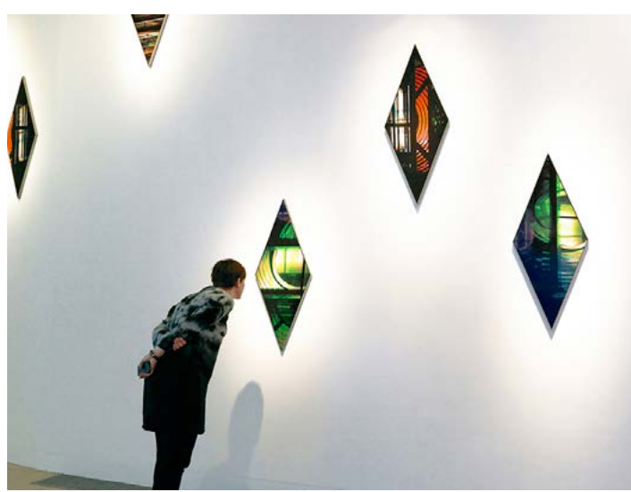
Installation shot, work by Steffi Klenz

Steffi Klenz's unusual images, specially made for the show, are based on the rhythmic and repeating pulse of the light signal of a lighthouse, and include a sound work made in collaboration with Neil Codling of the alternative rock group Suede.