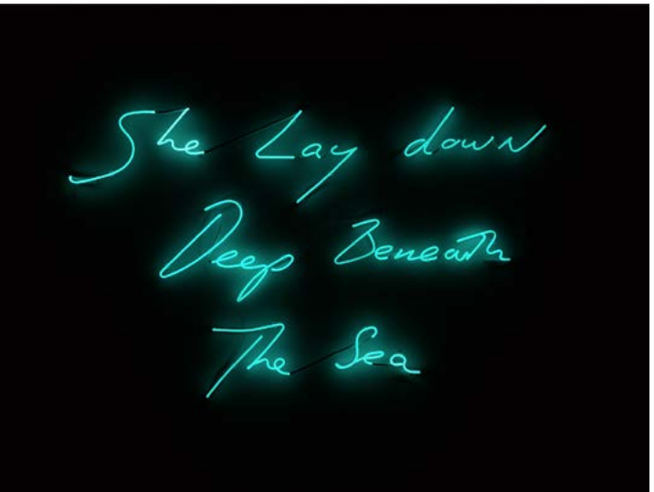
Neon Light Piece by Tracey Emin