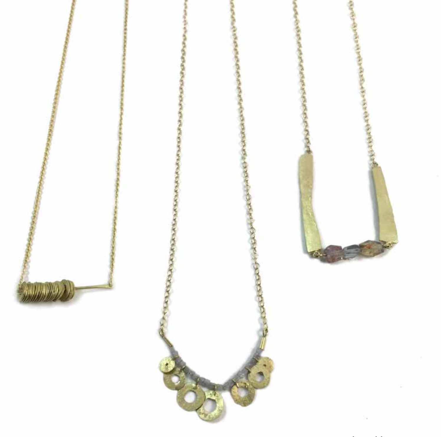
Forged Necklaces, 2015 18ct gold, sapphires and diamonds £1,100 - £1,500