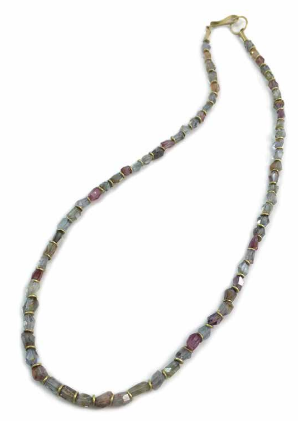
Irregular Sapphire Necklace, 2015 Irregular sapphires with forged 18ct gold discs £2,200