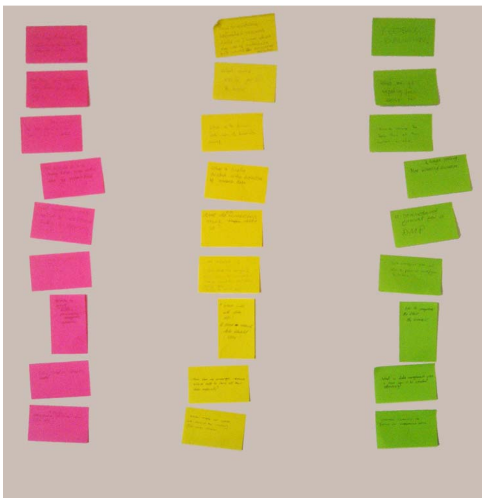
Fig.3 Research data collected during RDM training in January 2013

The feedback from this event was positive and informative with participants indicating that their knowledge of RDM had improved or improved considerably. One of the participants found the workshop was very interesting and helpful. The workshop enabled them to understand research data and research outputs within the visual arts. They also noted the complex nature of research data in this area and the value of the KAPTUR project. Those who came to the training also noted how they and or their departments had benefitted from attending. The responses ranged from understanding the term RDM and research data definitions for the visual arts to understanding research data in a broader context. Training is just the first step in another journey which will be to embed the policy into work practices and procedures.