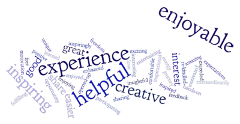
Figure 3 Wordle of student participant responses to the question: Please tell us about your experience of the Creative Writing group

Towards the end of the project (June 2012), we emailed students asking them to sum up their experiences of participating in Create Curate Collaborate! Results indicated that creative writing in the extracurricular groups had tangible benefits for students' assessed work. Many of the students attested to the benefit of the group for their academic writing and their studio work. The three examples below are representative of their replies: