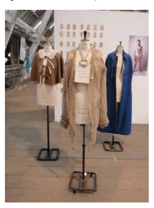
Figure 4 'The Cloak of Dreams' consists of three pieces: a reversible cape made of tweed and canvas (with a removable knitted string collar and leather button), a cardigan knitted out of hemp and enhanced with labels (with people's dreams written on them) and a reversible cloak made out of wool and canvas (with reversible and removable collar)

An example of studio work inspired by the project is The Cloak of Dreams (see figure 4), its creator explained that: