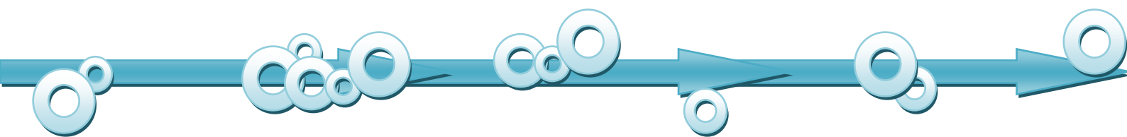
FIG.2. VISUAL ARTS RESEARCH AS A CONTINUUM OVER TIME WITH "ORGANISATIONAL MOMENTS" AT WHICH RESEARCH DATA MAY BE ACTUALISED